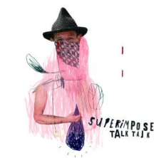
CD: Superimpose "Talk Talk", Leo Records, 2010